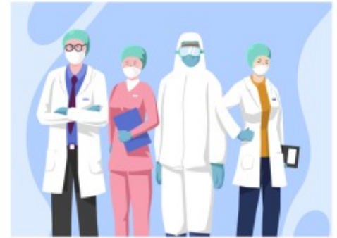
Employee wearing mask and gloves

WE ASK THAT YOU HELP US Maintain a safe environment by