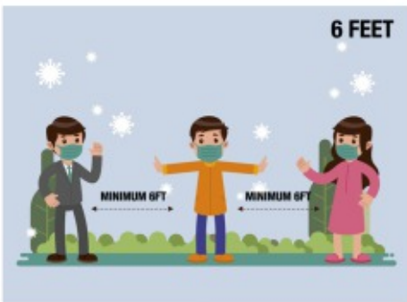
Practicing social and physical distancing

WE ASK THAT YOU HELP US Maintain a safe environment by