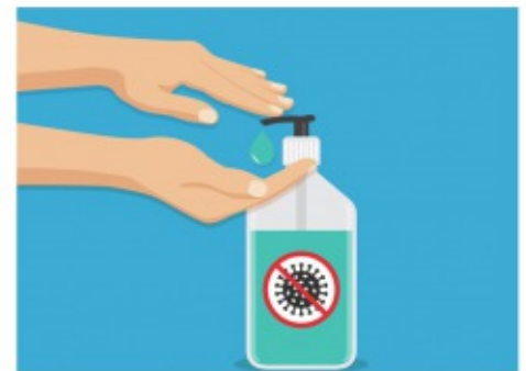
Washing and sanitizing your hand