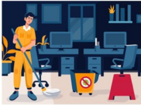
Continued extensive cleaning